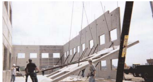
Precast tilt-up elements incorporating slag cement are made on the jobsite.

Slag cement is lighter in color than portland cement. Elements made with slag cement will therefore have a lighter finished color. The higher the percentage of slag cement used, the lighter the color will be. This provides greater visibility of the elements and potentially improved safety.