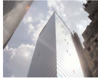
Figure 3: 7 World Trade Center - Manhattan

For the 45-story Helena residential high rise in Manhattan (Figure 2), use of 45% slag cement concrete in the structural beams and columns, and other cast-in-place concrete resulted in achieving both MR 4.1 and 4.2 credits, as well as an Innovation in Design point for reducing portland cement and commensurate embodied greenhouse gas emissions. The Helena is a LEED™ Gold Certified building and also achieved a New York State tax credit for sustainable structures.