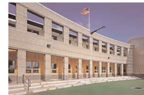
Figure 1: Clearview elementary School, Hanover

Slag cement has been used in numerous structures to help achieve LEED points. At Clearview Elementary School in Hanover, PA (Figure 1), 60% slag cement in the insulated concrete form walls and in other concrete elements helped boost the structure's recycled content to achieve MR 4.1 and 4.2 credits. Clearview Elementary is a LEED™ Gold Certified building, and also was the recipient of SCA's first annual award for "Best Use of Slag Cement in Sustainable Construction."