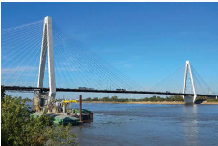
Figure 1: The I-70 Stan Musial Veterans Memorial Bridge (opened 2014) pylons used 70% slag cement in the mass concrete mix, which also was used in other concrete classes of the structures

Generally, 65 to 80% is considered an optimum replacement range for mass concrete applications. These levels typically provide significant heat reduction while achieving desired strengths. Levels from 50 to 65% have been used successfully in smaller mass concrete placements. Mixtures should be tested with job materials to ensure required thermal and strength characteristics.