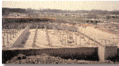
Figure 1: The Hap Cremeans water treatment plant in Columbus, OH used 30% slag cement with Type II portland cement to achieve sulfate resistance.

Waterborne sulfates react with hydration products of the tri-calcium aluminate