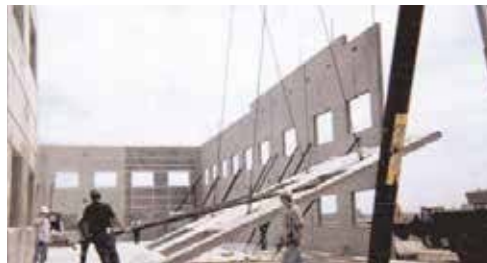
Precast tilt-up elements incorporating slag cement are made on the jobsite.

Slag cement is lighter in color than portland cement. Elements made with slag cement will therefore have a lighter finished color. The higher the percentage of slag cement used, the lighter the color will be. This provides greater visibility of the elements and potentially improved safety.