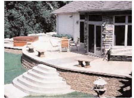
Completed exterior of a home with insulating concrete forms, in Wisconsin.

Slag cement can be used in almost any residential concrete application. It has been used in footings, basement walls, basement floor slabs, sidewalks, driveways, and garages. Slag cement has been used in mixes for above-grade insulating concrete form (ICF) concrete walls for safe, energy-efficient homes as well. In addition to these concrete applications, slag cement is also used in masonry construction.