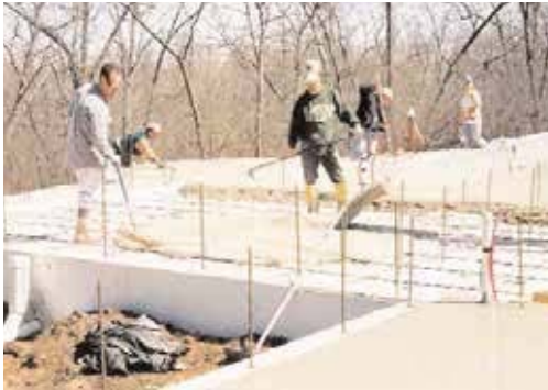
Self-consolidating concrete for residential floor slab using 50 percent slag cement, 50 percent portland cement.

Slag cement has been used extensively in residential construction with little or no impact on construction processes. Wall forms can usually be removed on the same schedule as other mixes. When backfilling a foundation, care must be taken by the excavator to make sure walls are not subjected to excessive pressures from machinery and backfill material. The same is true in walls containing slag cement.