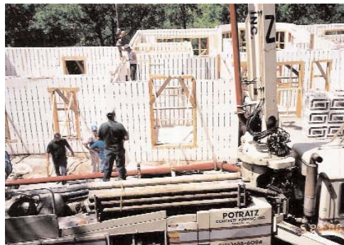
Insulating concrete form construction using concrete with 60 percent slag cement, 30 percent portland cement and 10 percent fly ash.

Slag cement is preferred in decorative concrete. Because of its lighter base color, colors may appear more vibrant in integrally colored and stamped concrete. Concrete containing slag cement can be acid etched and stained as well.