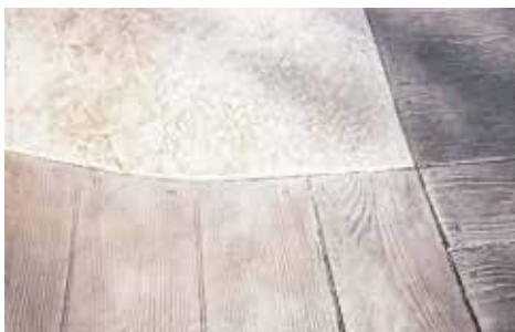
Decorative residential concrete with 25 percent slag cement: Interior acid stained concrete (top) and exterior stamped and colored concrete (bottom)

As with all concrete mixtures, trial batches should be performed to verify concrete properties. Results may vary due to a variety of circumstances, including temperature and mixture components, among other things. You should consult your slag cement professional for assistance. Nothing contained herein shall be considered or construed as a warranty or guarantee, either expressed or implied, including any warranty of fitness for a particular purpose.